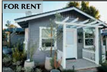
FOR RENT 397 Park Ave - Laguna Beach 2 Bed / 1 Bath - $4,995