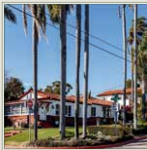
304 Myrtle Street $4,125,000