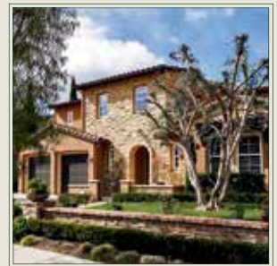
17 Calle Azeituna $2,825,000