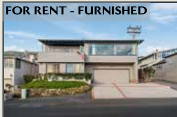
FOR RENT - FURNISHED 960 Cliff Drive - Laguna Beach 3 Bed / 2 Bath Vacation Rental; Inquire on Pricing