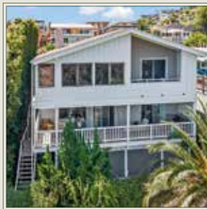
283 - 285 Dolphin $3,175,000