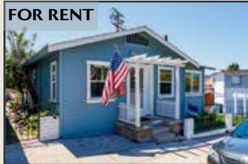
FOR RENT 363 Park Ave - Laguna Beach 2 Bed / 1 Bath - $4,695