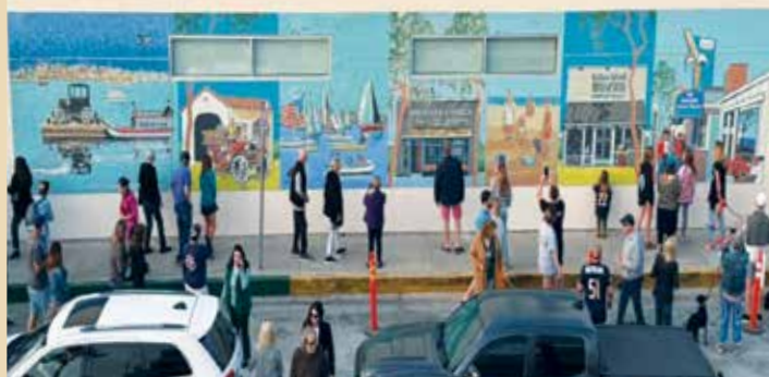
The Balboa Island Park Avenue Mural installed on the Irvine Ranch Market south blank wall on Park Avenue at Marine on Balboa Island.