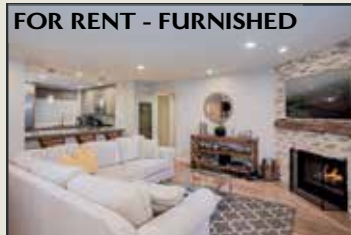
FOR RENT - FURNISHED 247 Calliope - Laguna Beach 3 Bed / 2 Bath - $6,500 Vacation Rental