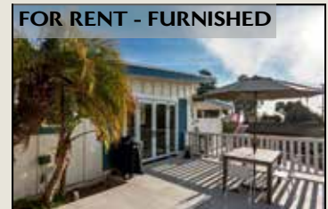
FOR RENT - FURNISHED 363 Ruby St - Laguna Beach 3 Bed / 3 Bath - $6,500 Vacation Rental