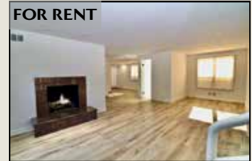
FOR RENT 548 Agate - Laguna Beach 2 Bed / 3 Bath - $6,995