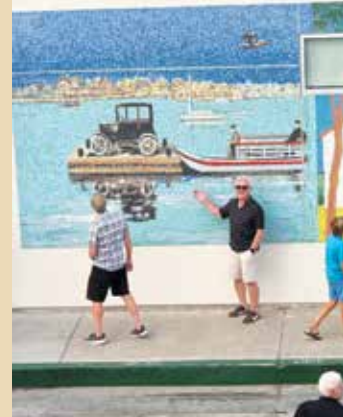
Mural Donor pointing to Balboa Island Ferry