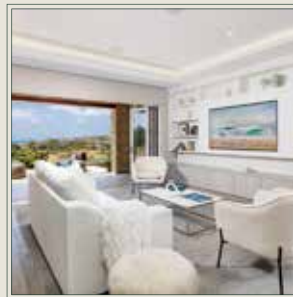
9 Monarch Beach Resort South $7,375,400